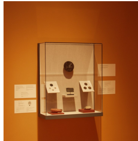
Classic Wall Case