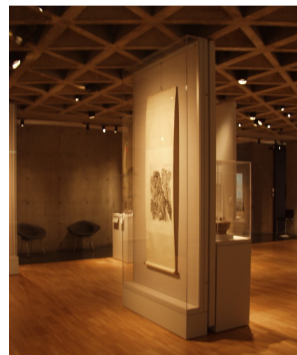
Hinged Sealed Wall Case with powdercoated frame, rolling base and fabric-wrapped deck.