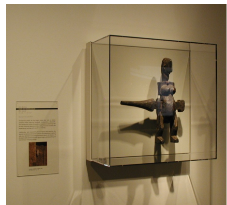
Sealed Wall Case with powdercoated aluminum frame and fabric-wrapped display deck.