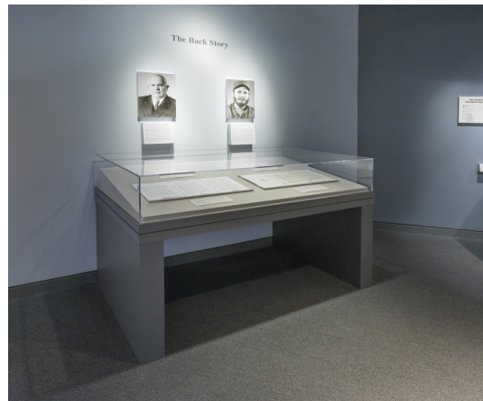
(Shown with optional raised deck)

Also sealed and archival, the M - Case is a more substantial option. The medex base can be finished in latex paint, plastic laminate or wood veneer. The museum-quality vitrine lifts off and can be fastened with security screws or pneumatic locks. Archival decks and external silica gel access are standard.