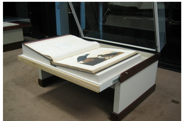
Decks can be flat or angled and often include pinnable linen-wrapped ethafoam, or HDPE for mounting. Roll-out decks offer easy access to large objects.