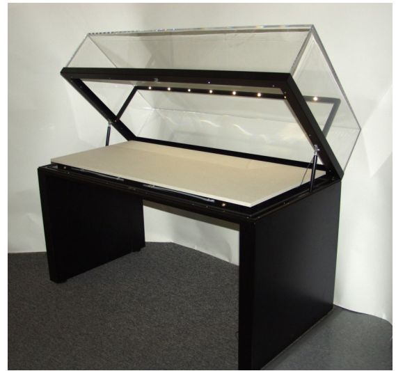
LED options include dimmable spotlights and dimmable, color-adjustable lightbars.