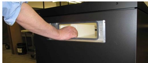
Most SmallCorp cases can be equipped with silica gel access ports so gel media can be changed without moving objects in the case