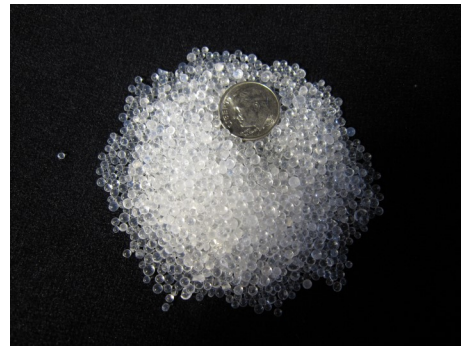
Type A beaded gel with equilibrium moisture content of 30% and M Value of 6.8 at 50% RH.