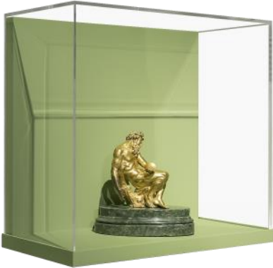
Mead Art Museum

All SmallCorp Wall Cases include integrated hanging cleats.