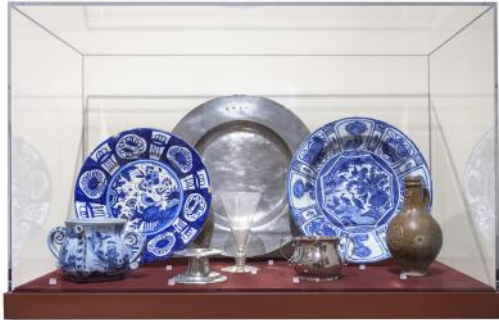
Yale University Art Gallery