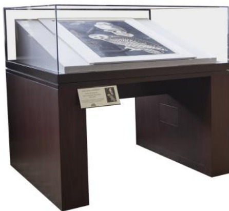
State Library of Massachusetts