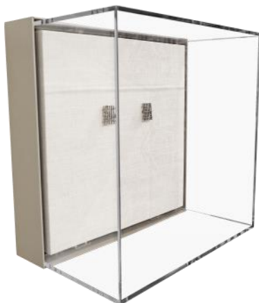
Framingham History Center

An archival, microclimate wall case consisting of a 2" powdercoated aluminum frame, removable deck, and acrylic vitrine. This case accommodates silica gel behind the display deck but does not include an external access door.