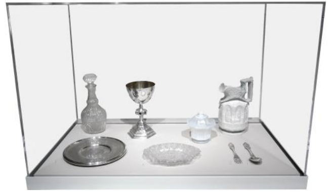
Yale University Art Gallery

This microclimate tabletop case has a 2" powdercoated aluminum collar.