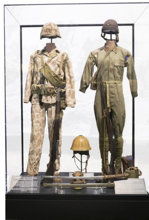
American Heritage Museum

A fixed Medex® deck in a non-archival and non-sealed mannequin case.