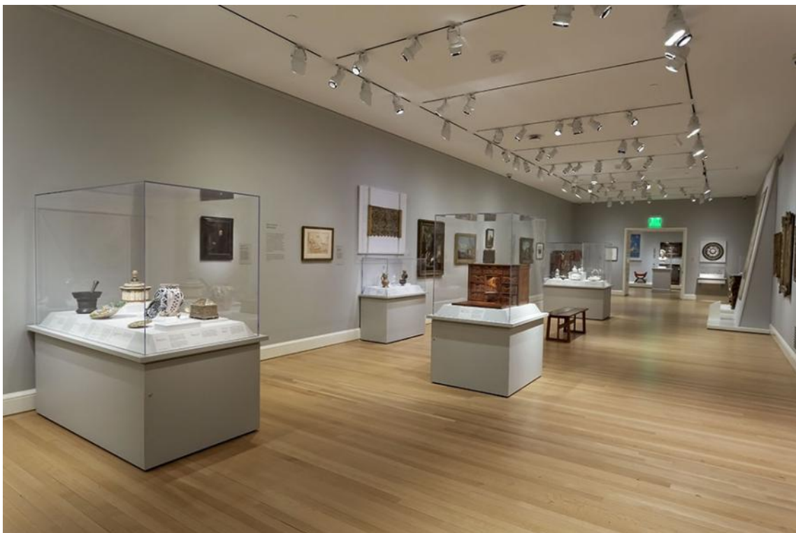
Left Page Top: Yale University Art Gallery Bottom: RISD Museum Right Page The Frick Collection