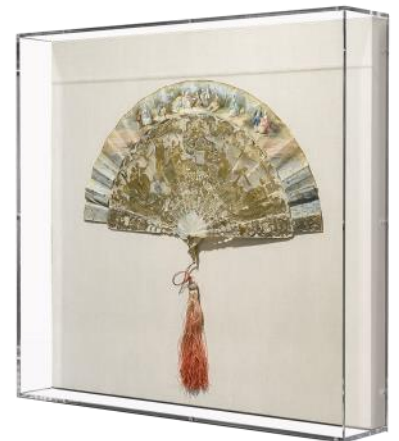
Mead Art Museum

An object shelf wall case that is not sealed nor archival. This case has a lift-off 4-sided acrylic vitrine.