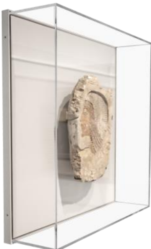
Worcester Art Museum

Our simplest solution to wall exhibition. An acrylic vitrine is secured to a finish edged backboard.