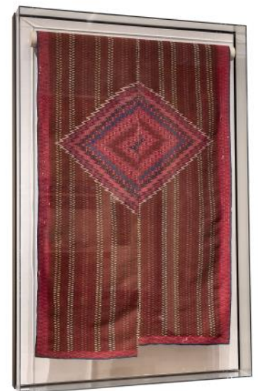
Peabody Museum at Harvard

A 1" powdercoated aluminum collar hides the edges of the fixed, finished Medex® deck and accommodates screws to secure the vitrine. This is a non-sealed and non-archival case.