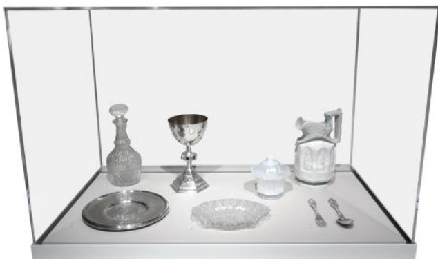
Yale University Art Gallery