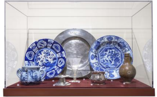
Yale University Art Gallery

Sealed, microclimate case with 3" aluminum collar with external access port to silica gel.