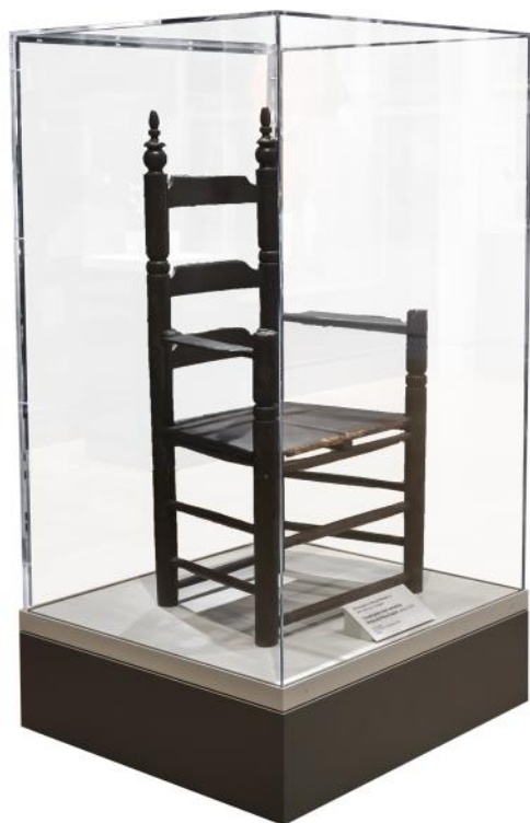
Peabody Essex Museum

Standard for this case is a fixed Medex® deck with options for internal textrails.