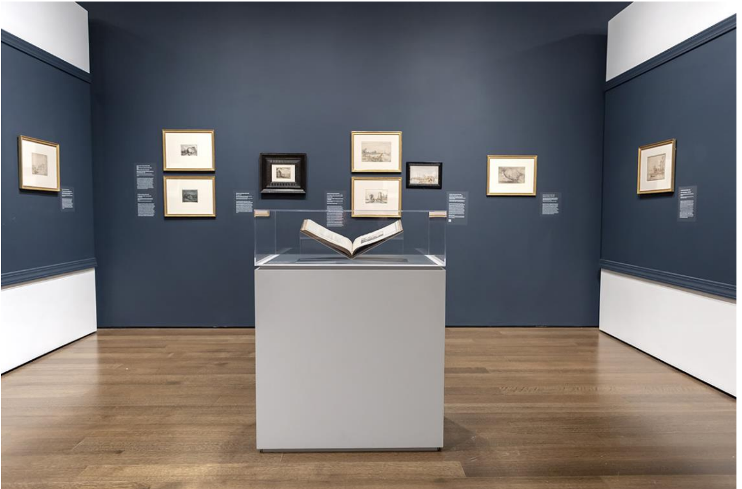
Harvard Art Museum

To ensure we are at the forefront of industry standards, we have continued to improve and refine our techniques and knowledge of materials over the last 50+ years.