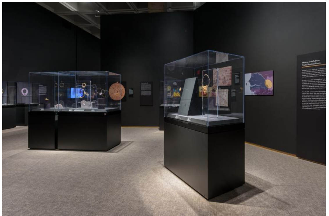
Top: The Brooklyn Museum Bottom: NC Museum of Art