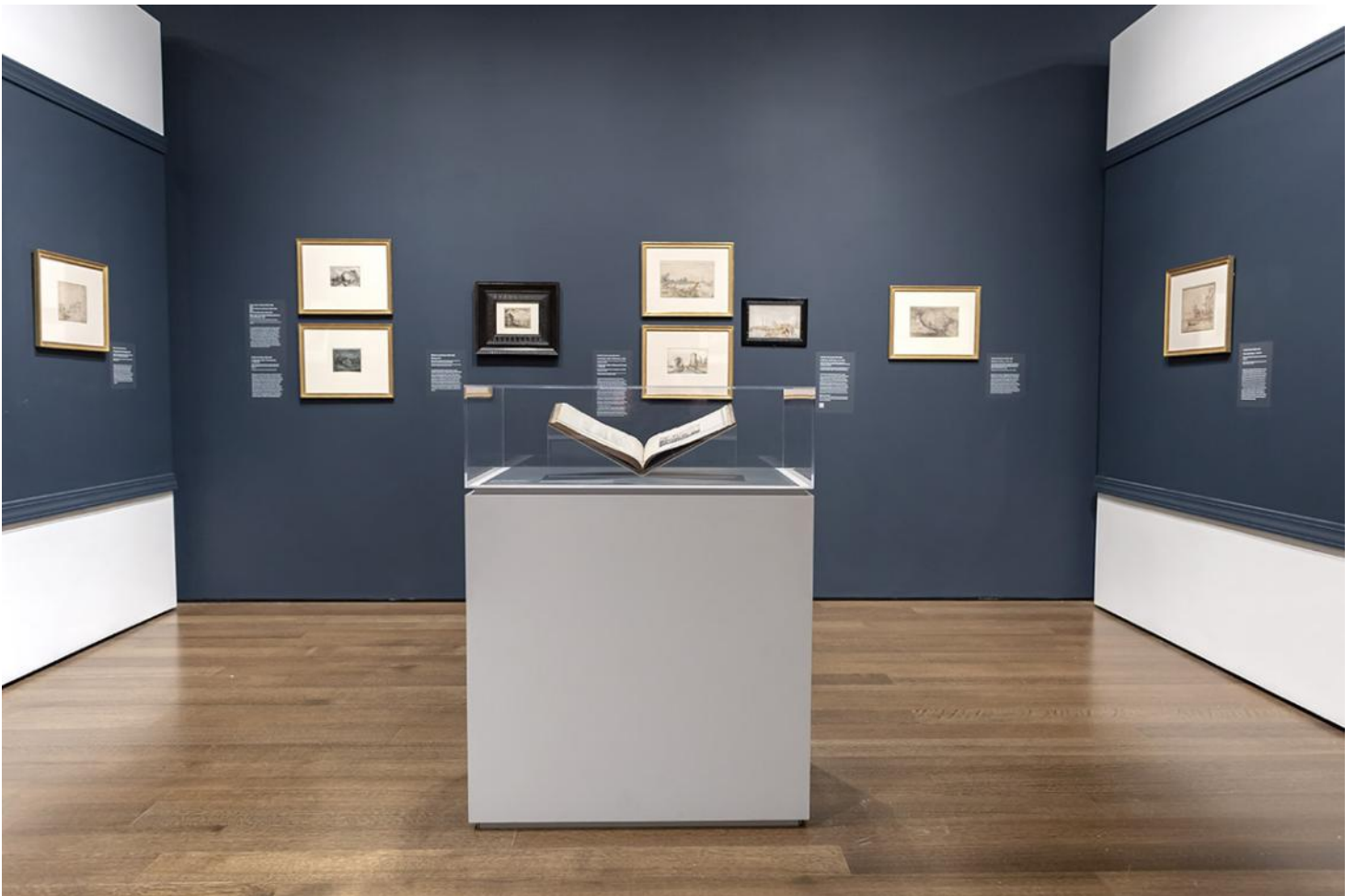
Harvard Art Museum

To stay at the forefront of industry standards, we continually improve and refine our techniques and understanding of materials.