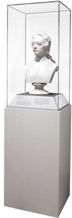
Worcester Art Museum

Featuring a step deck, this Medex® pedestal case protects your object from visitors and dust. This is a non-sealed and non-archival case.