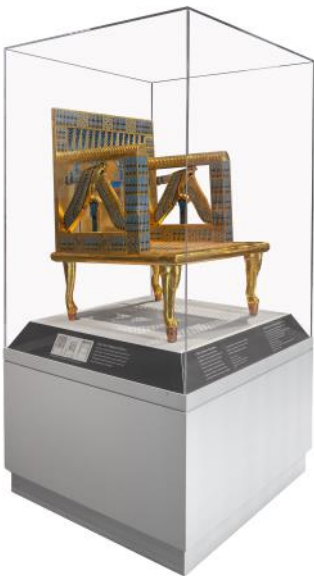
Peabody Museum at Harvard