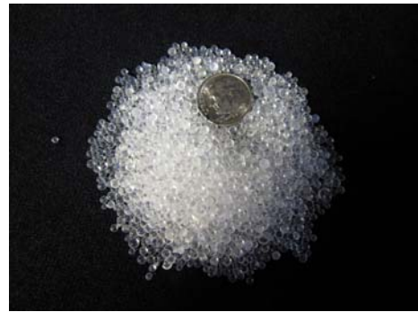
Type A beaded gel with equilibrium moisture content of 30% and M Value of 6.8 at 50% RH.