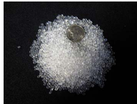
Type A beaded gel with equilibrium moisture content of 30% and M Value of 6.8 at 50% RH.