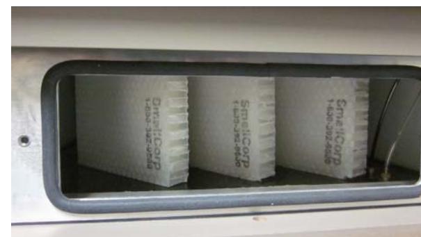
Most SmallCorp cases can be equipped with silica gel access ports so gel media can be changed without moving objects in the case